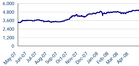
ADSM 1-Year Chart